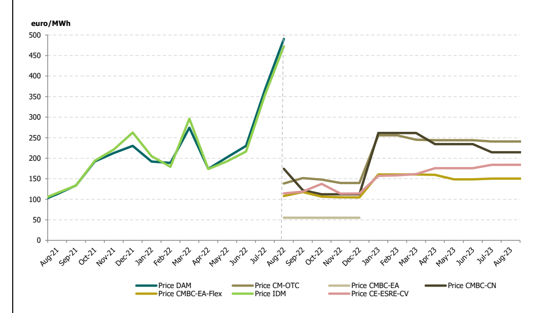
Figure 7: Monthly development of average price on DAM and on centralised market for bilateral contracts