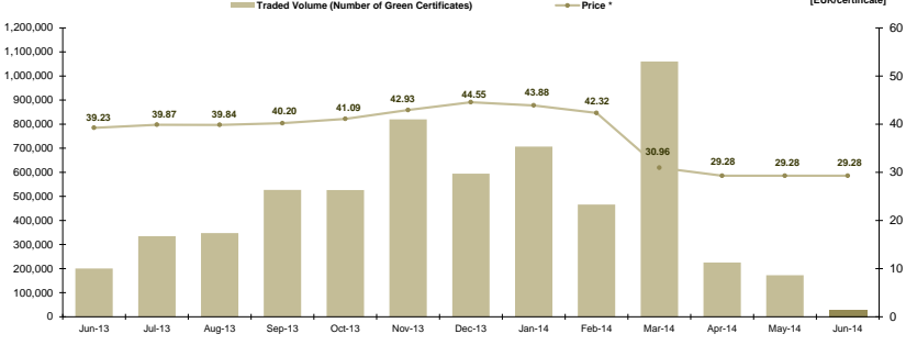
Figure 4: Monthly development for price and number of traded green certificates