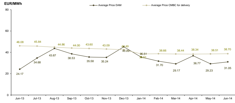
Figure 3: Monthly development for DAM average price and CMBC average price for deliveries according to concluded contracts